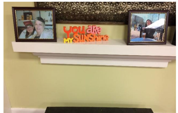
Figure 4 Side Mantle