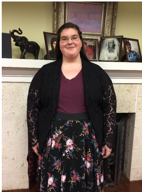
Figure 9 Katie's Flowered Skirt

reoccurring theme of dark and light throughout my performance. This theme relates to the darkness of loss and grief, and the light or sunshine represents the recovery process, the focus on the good memories, and the hope to come. Elephants have also been a part of the on-going metaphors within my performance. The poem I read by Tom Kettering provides words to describe why our grief can seem like an elephant in the room. Flowers were also used as a metaphor in a variety of ways. There were flowers placed around the room, on the cake, poster, program, sign-in sheet, and even my skirt.