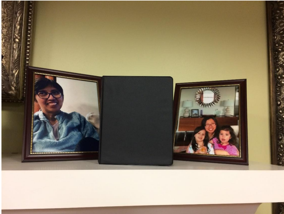
Figure 8 Black Book on Mantle