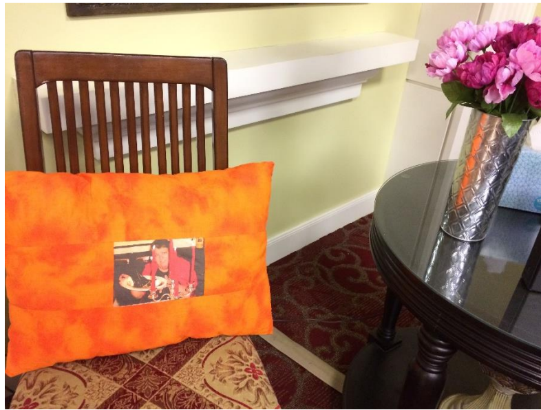
Figure 5 Side Chair with Pillow