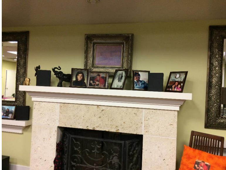
Figure 6 Umbrella Next to Fireplace Screen