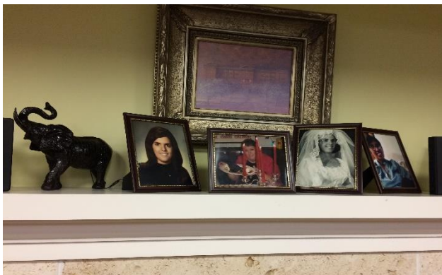
Figure 3 Fireplace Mantle

wall it was on. The mantle and surrounding tables and ledges served as platforms for the props or for photos of the loved ones discussed.