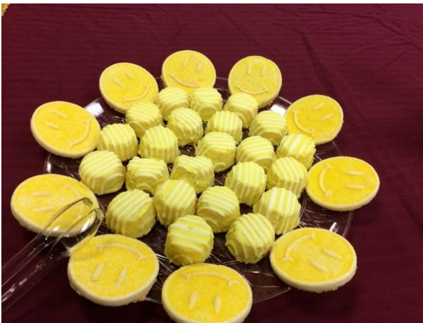
Figure 1 Sunshine Cupcakes

Then on the side with the fireplace, all the chairs were turned to face the fireplace and the