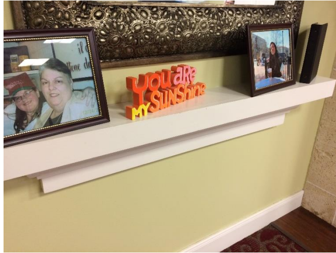
Figure 7 You Are My Sunshine Wooden Block

the audience, then move to the last of the four types of stories by telling a story that gives the audience hope or will let them walk away with a positive outlook on even dark situations (Stallings, 1997). These stories were shaped and woven into a 30-minute performance to explore communication and grieving.