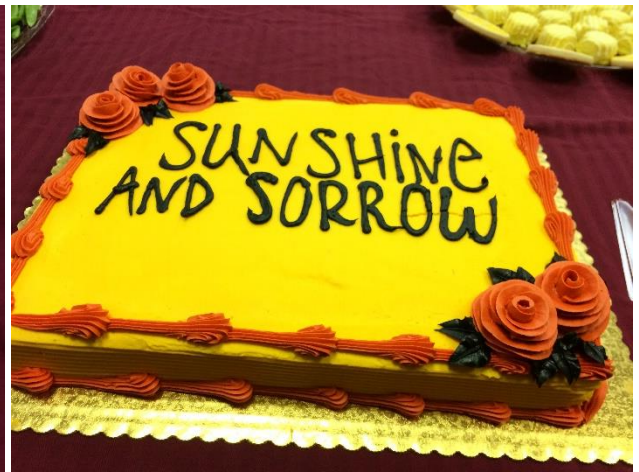
Figure 2 Sunshine/Sorrow Cake

wall it was on. The mantle and surrounding tables and ledges served as platforms for the props or for photos of the loved ones discussed.